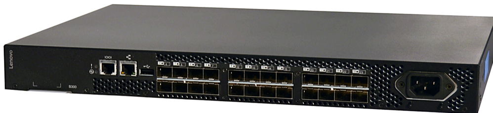
Figure 1. Lenovo

The following figure shows the Lenovo B300.