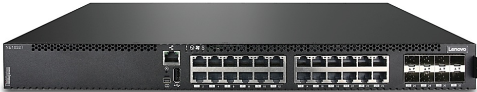
Figure 1. Lenovo ThinkSystem NE1032T RackSwitch

The Lenovo ThinkSystem NE1032T RackSwitch is shown in the following figure.