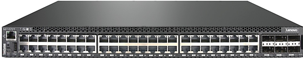
Figure 1. Lenovo ThinkSystem NE1072T RackSwitch

The Lenovo ThinkSystem NE1072T RackSwitch is shown in the following figure.