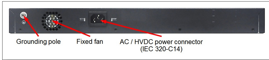
Figure 3. Rear panel of the CE0128P Switch

The rear panel of the CE0128P Switch is shown in the following figure.