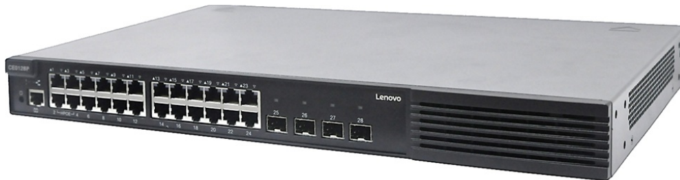
Figure 1. Lenovo CE0128P Switch

The Lenovo CE0128P Switch is shown in the following figure.