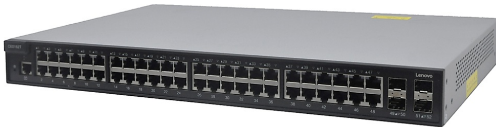
Figure 1. Lenovo CE0152T Switch

The Lenovo CE0152T Switch is shown in the following figure.