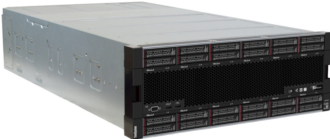
Figure 3. Lenovo ThinkSystem SR950

The following figure shows the Lenovo ThinkSystem SR950.