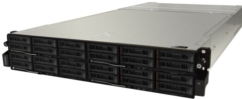
Figure 1. Four ThinkSystem SD530 servers installed in a D2 Enclosure

Lenovo has published leadership 2-socket (4-node) performance results for the SPECpower_ssj 2008 benchmark. The SPECpower_ssj 2008 benchmark is the first industry-standard benchmark that evaluates the power and performance characteristics of single server and multi-node servers.