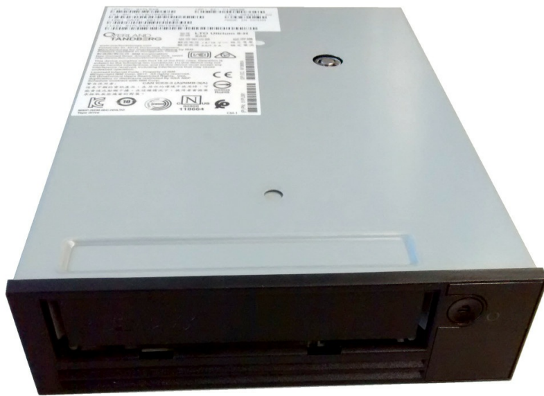
Figure 1. ThinkSystem Internal Half High LTO Gen8 SAS Tape Drive

Figure 1 shows the ThinkSystem Internal Half High LTO Gen8 SAS Tape Drive.