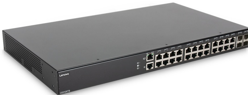
Figure 1. Lenovo CE0128TB Switch

The Lenovo CE0128TB Switch is shown in the following figure.