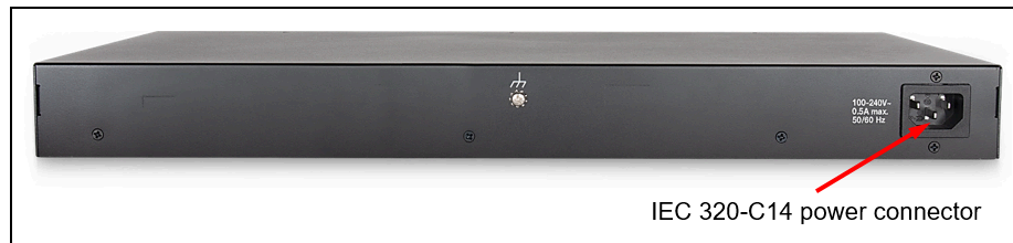
Figure 3. Rear panel of the

The following figure shows the rear (non-port-side) panel of the CE0152TB switch.