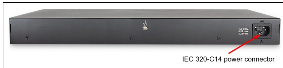
Figure 3. Rear panel of the CE0152TB switch

The following figure shows the rear (non-port-side) panel of the CE0152TB switch.