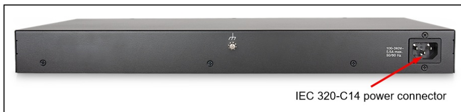
Figure 3. Rear panel of the CE0152PB switch

The following figure shows the rear (non-port-side) panel of the CE0152PB switch.