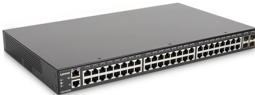
Figure 1. Lenovo CE0152PB Switch

The Lenovo CE0152PB Switch is shown in the following figure.