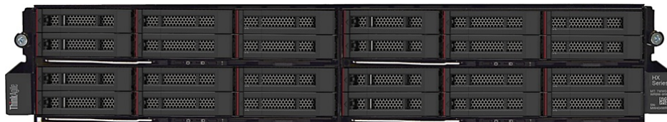
Figure 1. ThinkAgile HX3720 Appliances in the HX Series Enclosure

The ThinkAgile HX3720 appliances in the HX Series Enclosure are shown in the following figure.