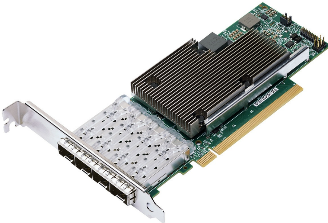
Figure 2. ThinkSystem Broadcom 57454 10/25GbE SFP28 4-port PCIe Ethernet Adapter

The following figure shows the ThinkSystem Broadcom 57454 10/25GbE SFP28 4-port PCIe Ethernet Adapter.