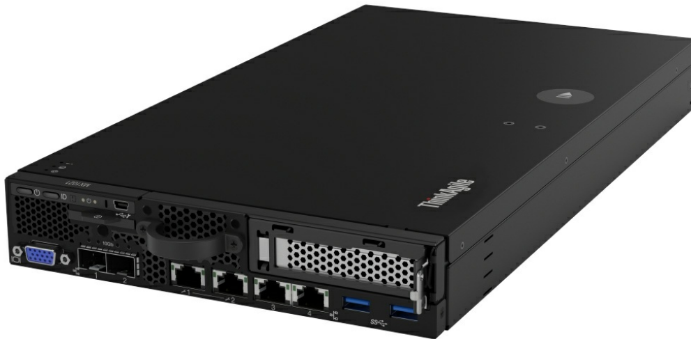
Figure 2. ThinkAgile MX1021 Certified Node

The new ThinkAgile MX1021 offering from Lenovo combines these features with the Azure Stack HCI capabilities of Windows Server 2019 Datacenter Edition to provide the perfect combination of hybrid computing for the edge.