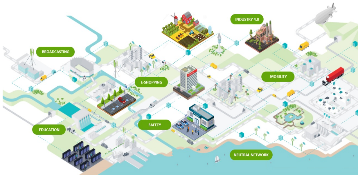
Figure 1. High-level view of use cases to be implemented

It involves deploying and testing innovative solutions in sectors as relevant as education, industry, commerce, tourism, transport, etc. that could lead in the future to generalize these services for all citizens through the installation of thousands of servers taking advantage of high-speed and low latency 5G networks.