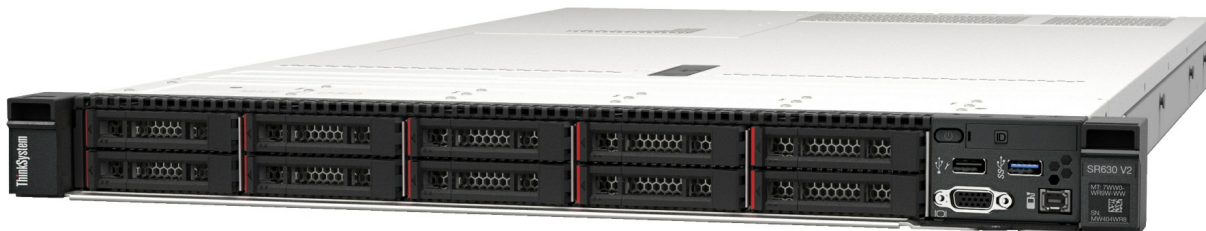
Figure 2. WEKA node - ThinkSystem SR630 V2

WEKA delivers a differentiated solution that goes beyond the current market and performance standards for storage. The partnership with Lenovo delivers the best solutions for your IT and business challenges.