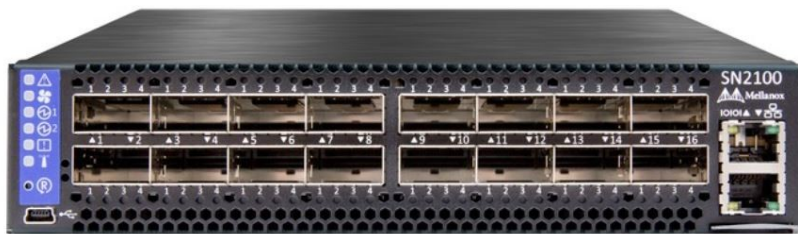
Figure 1. NVIDIA SN2100

The SN2100 is suitable for customers who need faster access to data to support business-critical workloads and applications such as database and analytics, and have a need for seamless transition to 100GbE switching.