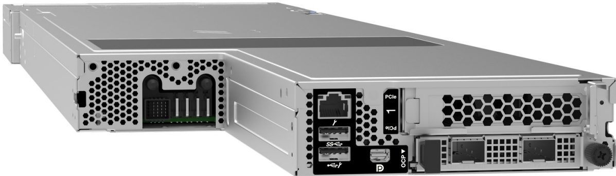
Figure 6. Rear – ThinkSystem SD530 V3