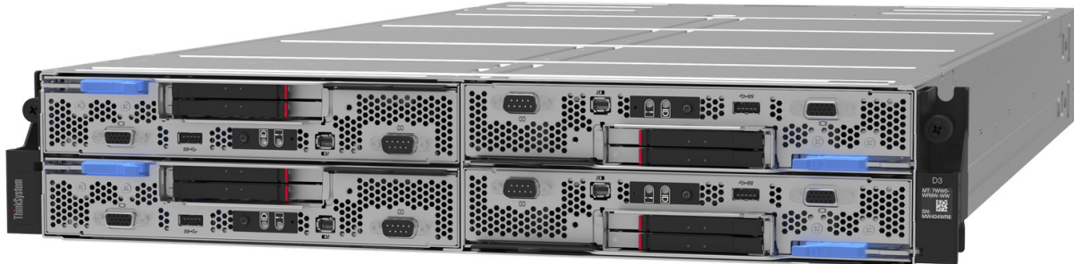
Figure 2. Front View - SD530 V3 Nodes installed in D3 Chassis

When installing nodes in the chassis, the nodes on the left side are installed right-side up and the nodes on the right are installed upside-down. SD530 V3 and SD550 V3 Nodes can be mixed within the D3 Chassis. The nodes and especially the phase change heatsinks have been specifically designed to work equally well in either orientation.