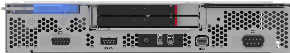
Figure 5. Front – ThinkSystem SD530 V3