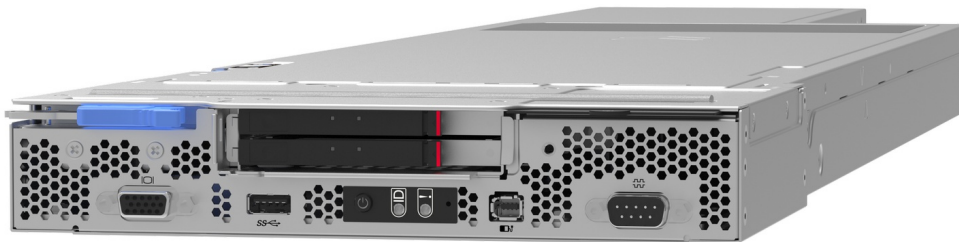
Figure 1. ThinkSystem SD530 V3

The SD530 V3 is well suited for workloads ranging from cloud, to AI and high-performance computing applications like Computer Aided Engineering (CAE) or Electronic Design Automation (EDA).