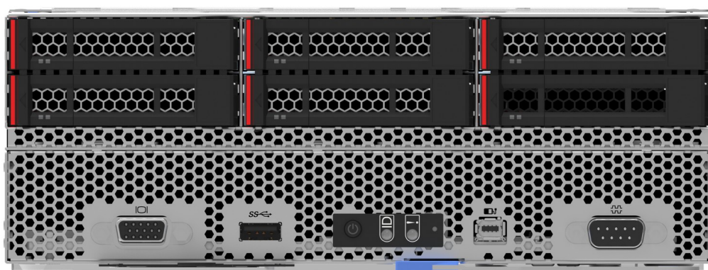
Figure 5. Front – ThinkSystem SD550 V3