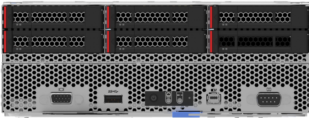
Figure 5. Front – ThinkSystem SD550 V3