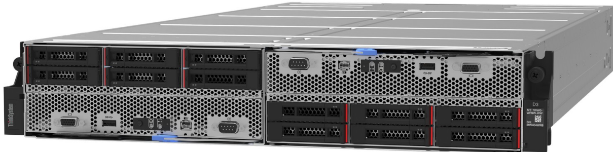
Figure 2. Front View - SD550 V3 Nodes installed in D3 Chassis

When installing nodes in the chassis, the nodes on the left side are installed right-side up and the nodes on the right are installed upside-down. SD530 V3 and SD550 V3 Nodes can be mixed within the D3 Chassis. The nodes and especially the phase change heatsinks have been specifically designed to work equally well in either orientation.