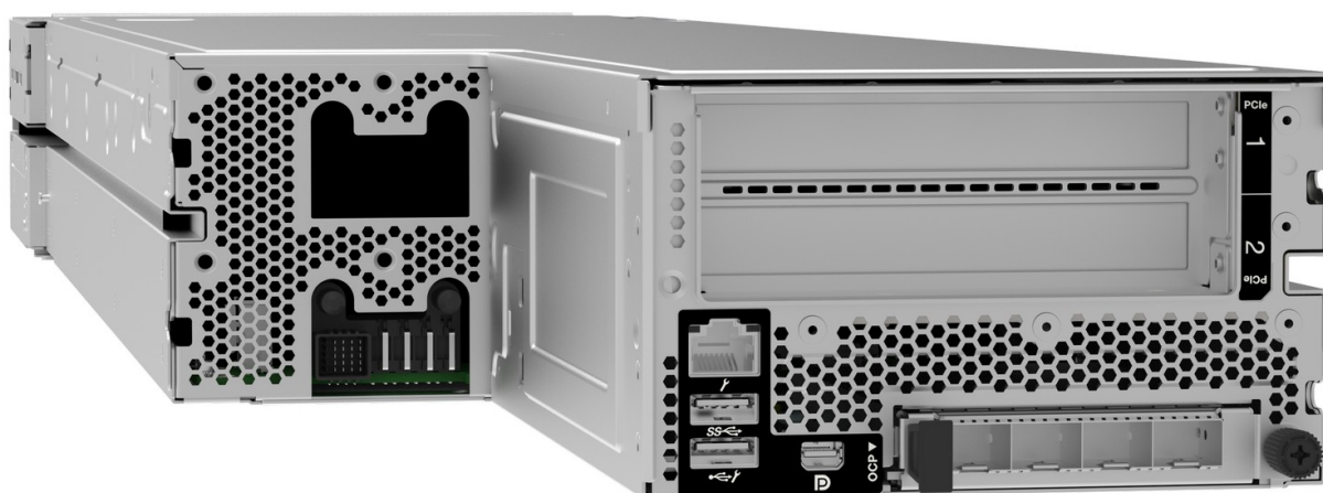
Figure 6. Rear – ThinkSystem SD550 V3