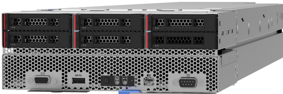
Figure 1. ThinkSystem SD550 V3

The SD550 V3 is well suited for workloads ranging from cloud, to AI and high-performance computing applications like Computer Aided Engineering (CAE) or Electronic Design Automation (EDA).