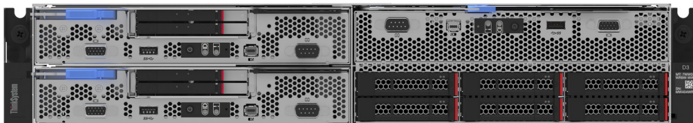
Figure 4. Front View - SD530 V3 Nodes and SD550 V3 Node installed in D3 Chassis

The advantages of the D3 Enclosure design includes: