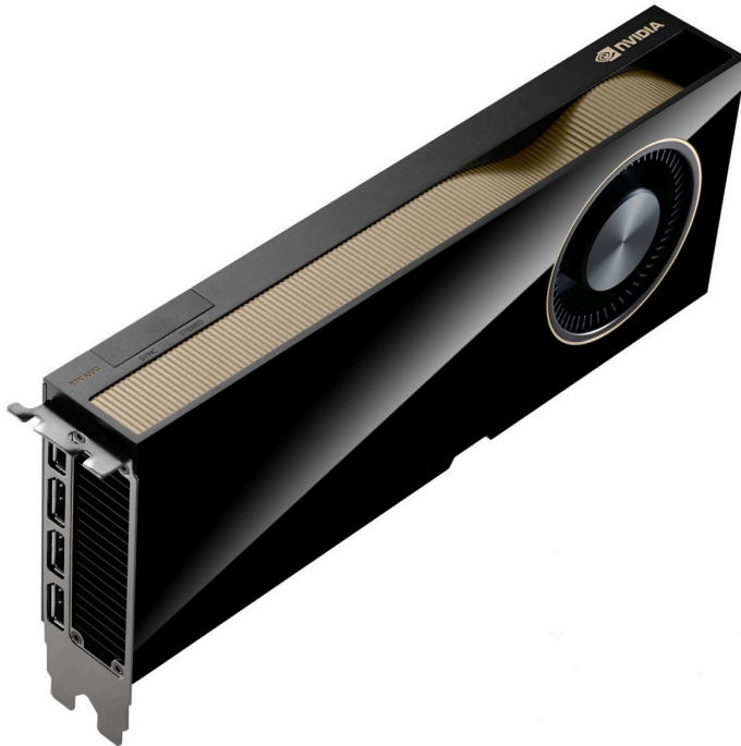
Figure 1. ThinkSystem NVIDIA RTX 6000 Ada 48GB PCIe Active GPU

Built on the NVIDIA Ada Lovelace architecture, the RTX 6000 combines 142 third-generation RT Cores, 568 fourth-generation Tensor Cores, and 18,176 CUDA® cores with 48GB of error correction code (ECC) graphics memory. This all helps deliver the next generation of AI graphics and petaflop inferencing performance for unprecedented speed-up in rendering, AI, graphics, and compute workloads.