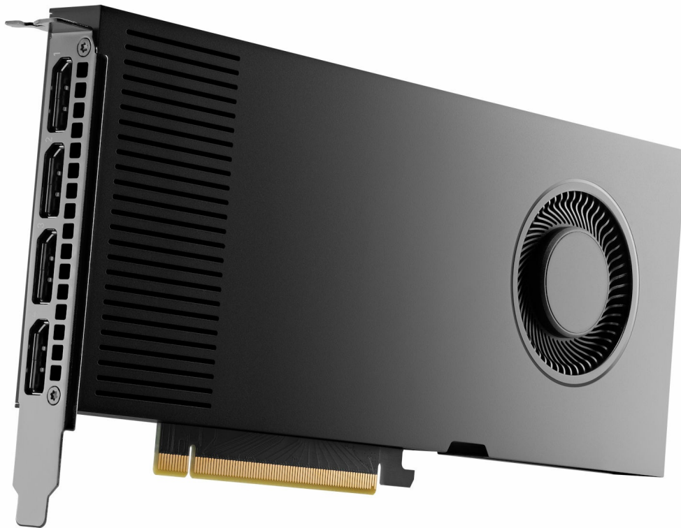
Figure 1. ThinkSystem NVIDIA RTX 4000 Ada 20GB PCIe Active GPU

The ThinkSystem NVIDIA RTX 4000 Ada 20GB PCIe Active GPU is a powerful single-slot GPU for professionals, delivering acceleration for AI, real-time rendering, graphics, and compute workloads. Built on the NVIDIA Ada Lovelace architecture, RTX 4000 combines 48 third-generation RT Cores, 192 fourth-generation Tensor Cores, and 6,144 CUDA cores with 20GB of graphics memory to effortlessly handle large datasets and complex visual workloads.