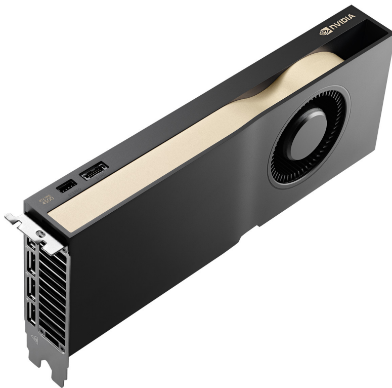
Figure 1. ThinkSystem NVIDIA RTX PRO 4500 Blackwell Workstation Edition PCIe Gen5 GPU

The NVIDIA RTX PRO 4500 Blackwell Workstation Edition redefines professional workflows with groundbreaking AI acceleration, neural rendering, and 32GB of ultra-fast memory. Built on the NVIDIA Blackwell architecture, it features 5th Gen Tensor Cores, 4th Gen RT Cores, and advanced CUDA cores to power next-generation creative, engineering, and scientific applications. Professionals can securely deploy agentic AI systems using NVIDIA NemoClaw, run physics simulations, and render cinematic-quality 3D worlds, all while handling massive datasets and complex workloads with ease.