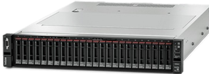
Lenovo ThinkAgile MX certified node