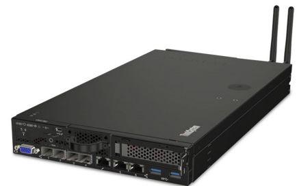
ThinkEdge SE350 Server