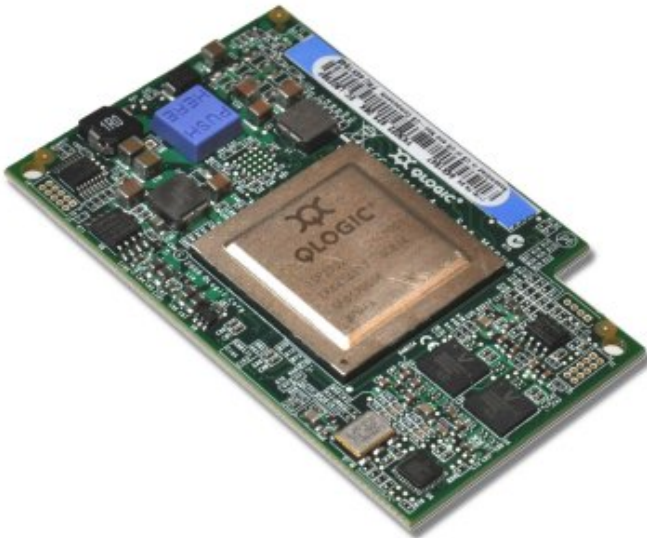
Figure 1. QLogic 8Gb Fibre Channel Expansion Card (CIOv)

Figure 1 shows the QLogic 8Gb Fibre Channel Expansion Card (CIOv).