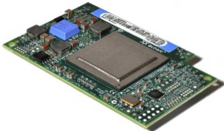
Figure 1. QLogic 4Gb Fibre Channel Expansion Card (CIOv)

The QLogic 4Gb Fibre Channel Expansion Card (CIOv) is shown in Figure 1.