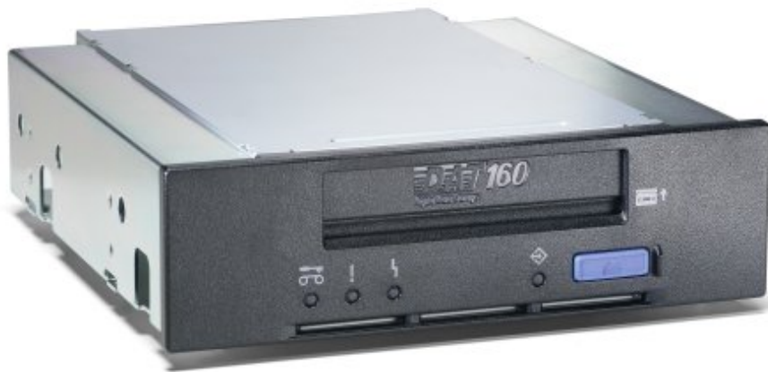
Figure 1. The DDS Generation 6 USB Tape Drive (5.25-inch form factor)

Figure 1 shows the DDS Generation 6 USB Tape Drive.