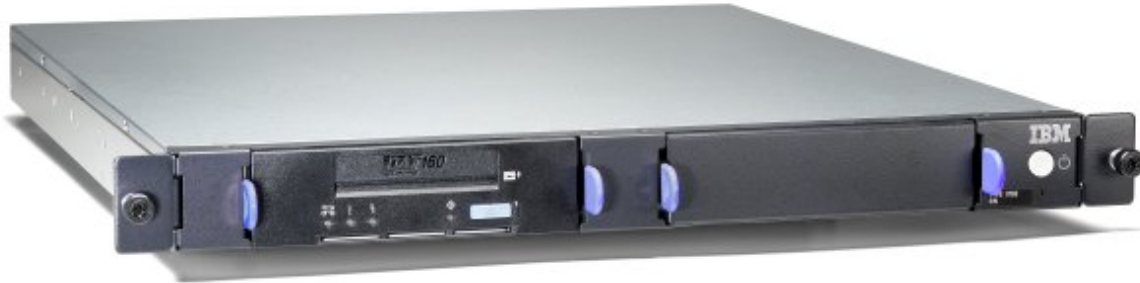
Figure 4. DDS Generation 6 USB Tape Drive installed in the 1U Rackmount Tape Enclosure

Figure 4 shows the tape drive installed in the IBM 1U Rackmount Tape Enclosure (87651UX).