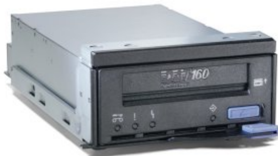
Figure 3. DDS Generation 6 USB Tape Drive installed in the IBM DDS Tape Enablement Kit

Figure 3 shows the tape drive installed in the IBM DDS Tape Enablement Kit. This kit converts the tape drive to a 3.5-inch form factor for installation in supports servers (see Table 3).