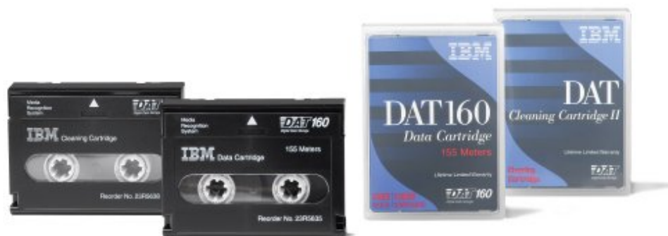
Figure 2. Media and cleaning cartridge

Figure 2 shows the supported media and cleaning cartridge.