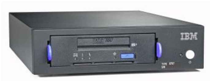
Figure 5. DDS Generation 6 USB Tape Drive installed in the Half High Tabletop Tape Enclosure

Figure 5 shows the tape drive installed in the IBM Half High Tabletop Tape Enclosure (8767HHX).