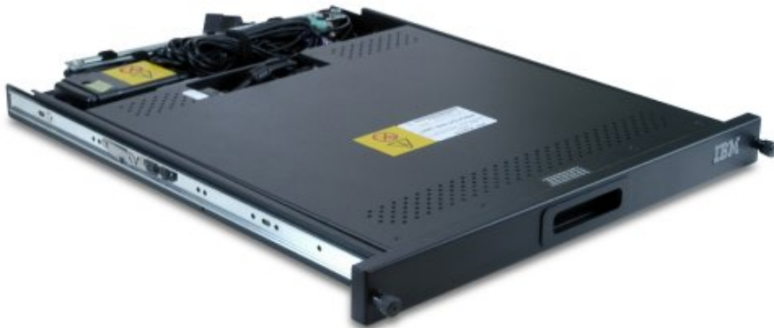
Figure 3. IBM 1U 19-inch Flat Panel Console Kit

Figure 3 shows the IBM 1U 19-inch Flat Panel Console Kit in the closed position.