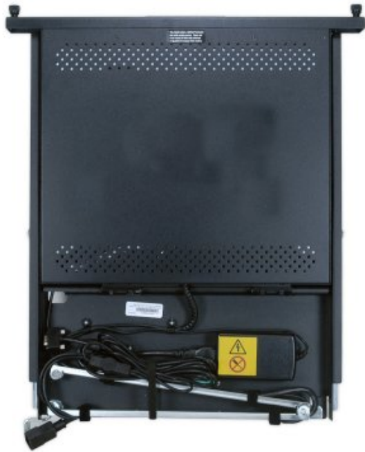
Figure 4. IBM 1U 17-inch Flat Panel Console Kit

Figure 4 shows the 17-inch Flat Panel Console Kit in the closed position.