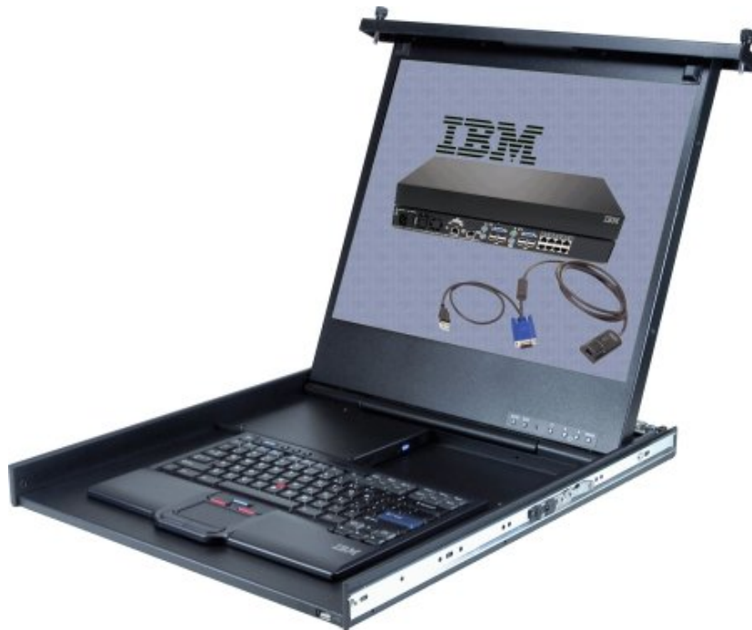
Figure 1. IBM 1U 19-inch Flat Panel Console Kit with the IBM UltraNav USB US English keyboard

These kits include either a 17" or 19" LCD display and accept an UltraNav keyboard available in 29 languages (the keyboard must be ordered separately). The 19-inch kit also includes as standard a multi-burner drive and USB port for additional convenience.