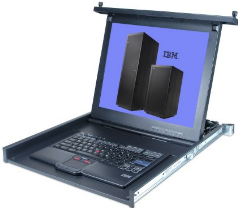
Figure 2. IBM 1U 17-inch Flat Panel Console Kit with the IBM UltraNav USB US English keyboard

Note: The console kits do not include a keyboard. See Table 2 for the supported USB keyboards and Table 3 for the supported PS/2 keyboards.