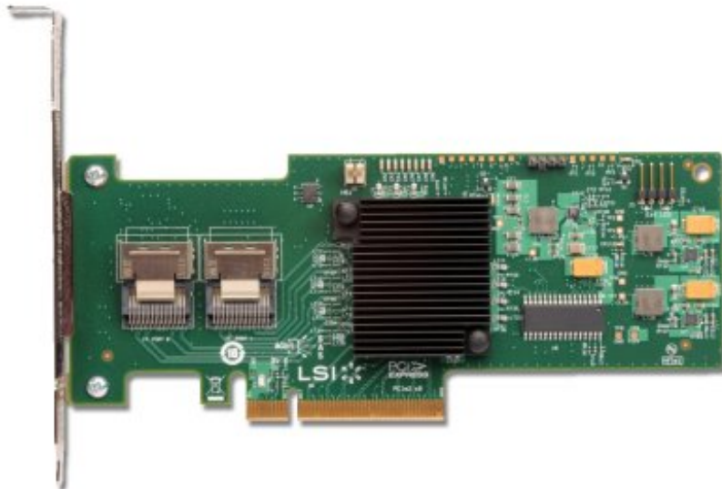
Figure 1. ServeRAID M1015 SAS/SATA Controller

The ServeRAID M1015 SAS/SATA Controller for System x is an entry-level 6 Gbps SAS 2.0 PCI Express 2.0 RAID controller. The adapter has two internal mini-SAS connectors to drive up to 16 devices and supports the same base RAID 0, 1, and 10 feature set and drivers as the M5000 series controllers. With the attachment of the ServeRAID M1000 Advanced Feature Key, the ServeRAID M1015 offers the option of RAID 5 and SED Encryption Key management, while still being sensitive to administrator cost concerns in an entry-level RAID environment. This RAID controller provides connectivity to internal direct-attach or expander-attached hard disk, solid-state, or self-encrypting drives.