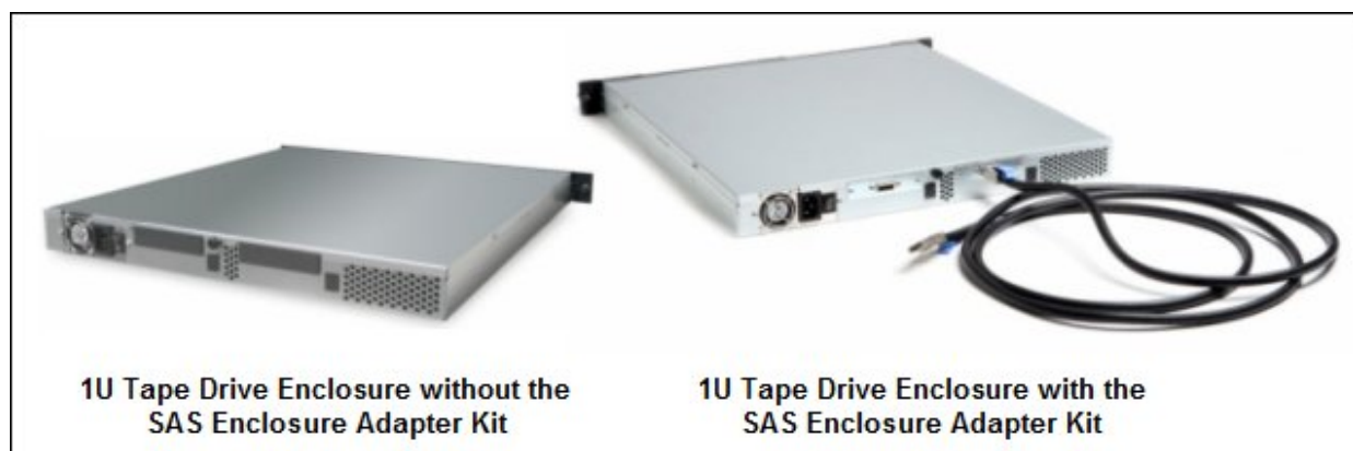
Figure 6. The 1U Tape Drive Enclosure with and without the SAS Enclosure Adapter Kit

The following figure shows an IBM 1U Tape Drive External Enclosure without the SAS Adapter Kit and after installing the SAS Adapter Kit.