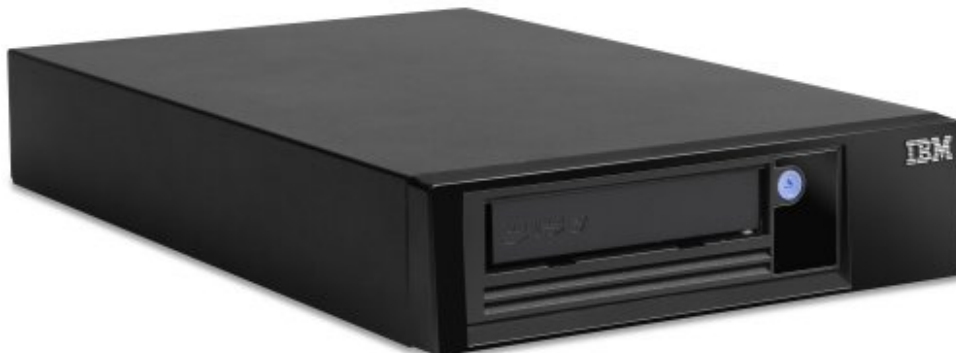
Figure 2. IBM External Half High LTO Gen 3 SAS Drive

Figure 2 shows the IBM External Half High LTO Gen 3 SAS Drive.