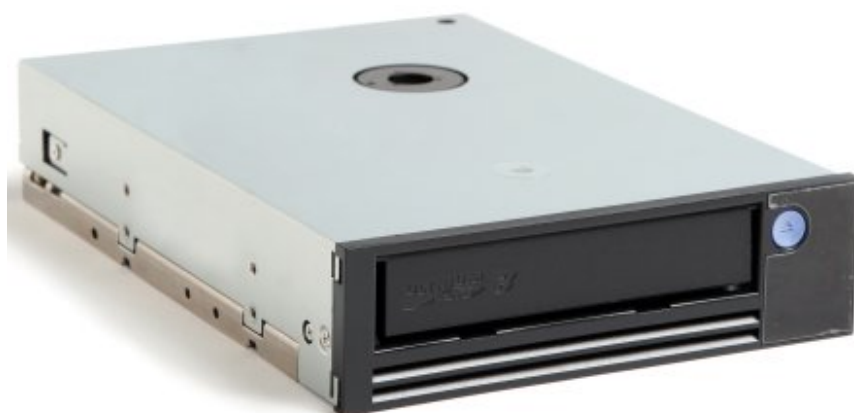
Figure 1. IBM Internal Half-high LTO Generation 3 SAS Tape Drive

Figure 1 shows the IBM Internal Half-high LTO Generation 3 SAS Tape Drive.