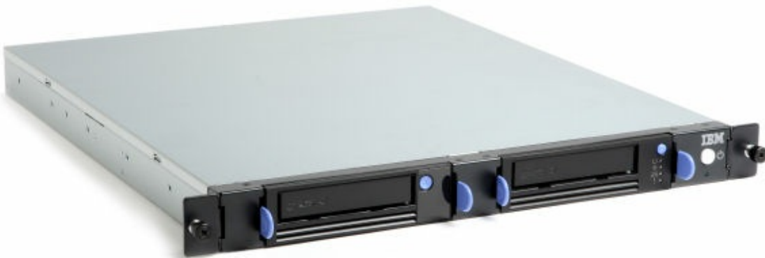
Figure 3. The tape drive installed in the 1U Rack-mount Tape Enclosure

The following figure shows the IBM Half-high LTO Generation 3 SAS Tape Drive installed in the right-most bay of the IBM 1U Rack-mount Tape Enclosure (87651UX):