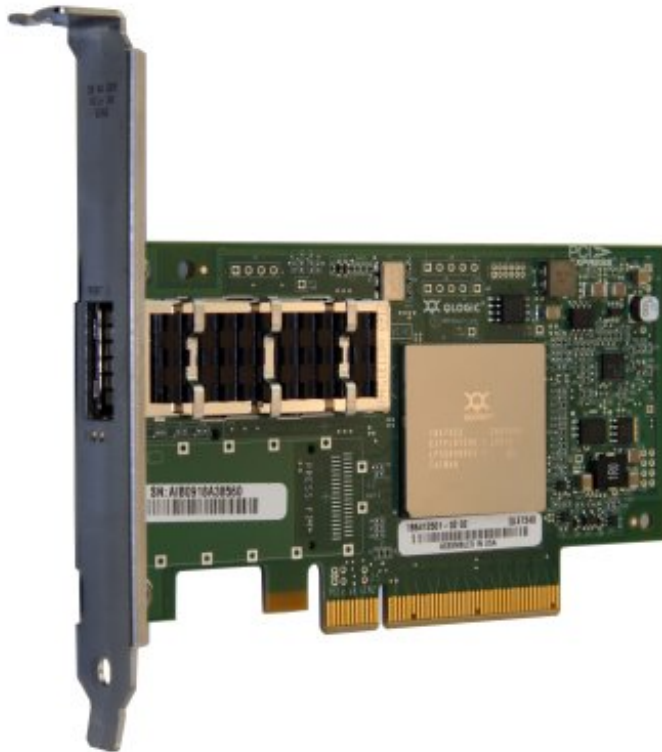
Figure 1. QLogic QLE7340 Single-Port 40 Gbps QDR InfiniBand HCA

Figure 1 shows the QLogic QLE7340 single-port 4X QDR IB PCIe 2.0 X8 host channel adapter.