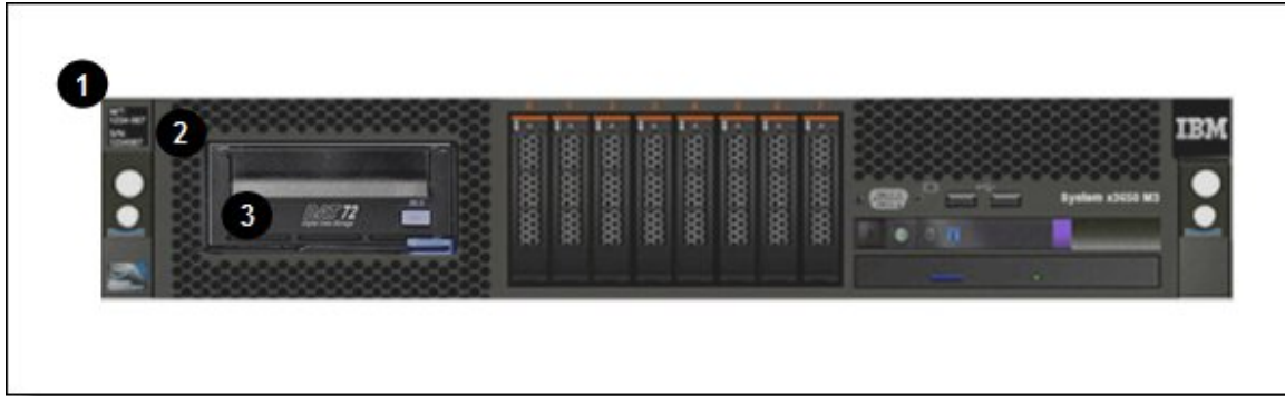
Figure 6. The DDS Generation 5 USB Tape Drive installed internally in an x3650 M3 server