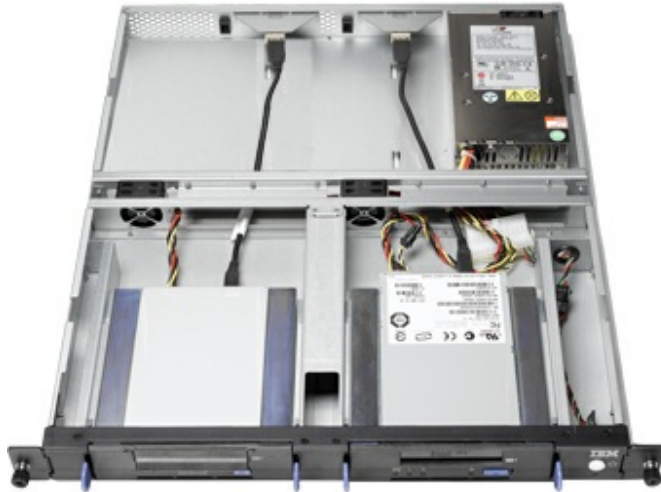
Figure 4. DDS Generation 5 USB Tape Drive installed with an open view of the 1U Rackmount Tape Enclosure

Figure 5 shows the tape drive installed in the IBM Half High Tabletop Tape Enclosure (8767HHX).