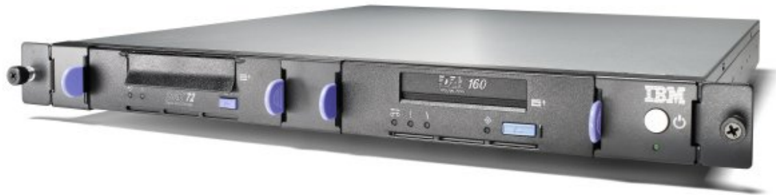
Figure 3. DDS Generation 5 USB Tape Drive installed in the 1U Rackmount Tape Enclosure (left bay)

Figure 3 shows the tape drive installed in the left bay of the IBM 1U Rackmount Tape Enclosure (87651UX).