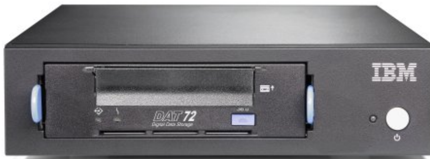
Figure 5. DDS Generation 5 USB Tape Drive installed in the Half High Tabletop Tape Enclosure

Figure 5 shows the tape drive installed in the IBM Half High Tabletop Tape Enclosure (8767HHX).