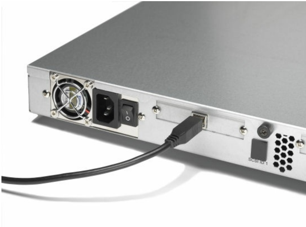
Figure 8. The DDS Generation 5 USB Tape Drive connection to the back of the external tape drive enclosure.

Figure 8 shows the USB cable connection to the back of the IBM 1U Tape Drive External Enclosure. The USB cable is part of the USB Enclosure Adapter Kit.