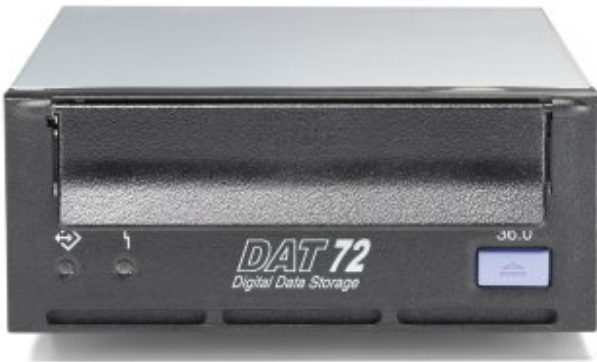
Figure 2. DDS Generation 5 USB Tape Drive converted to 3.5 inch form factor (required for installation internally in supported System x servers)

Figure 2 shows the tape drive installed in the IBM DDS Tape Enablement Kit. This kit converts the tape drive to a 3.5 inch form factor for installation in supported servers (see Table 2). An example of such installation is shown in Figure 6.