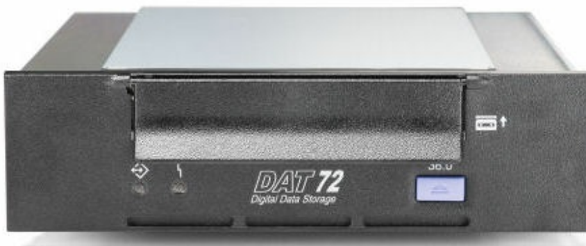
Figure 1. The DDS Generation 5 USB Tape Drive

Figure 1 shows the DDS Generation 5 USB Tape Drive in its 5.25 inch form factor.