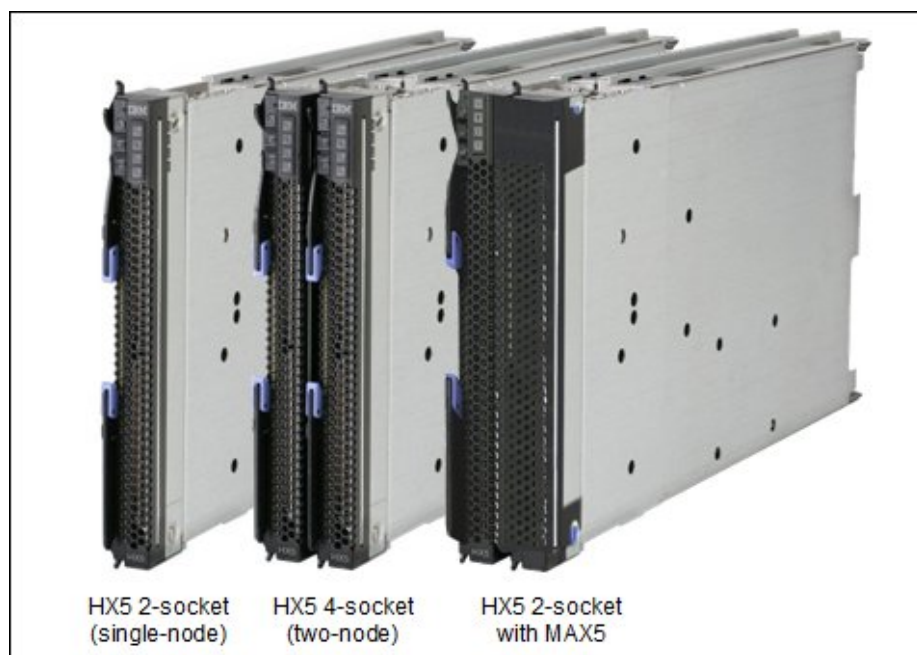
Figure 1. IBM BladeCenter HX5

Figure 1 shows the IBM BladeCenter HX5 in the three scalable configurations.