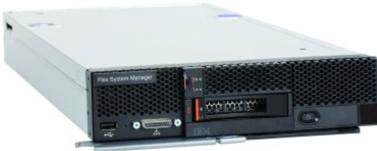
Figure 1. IBM Flex System Manager management appliance

The IBM Flex System Manager management appliance is shown in the following figure.