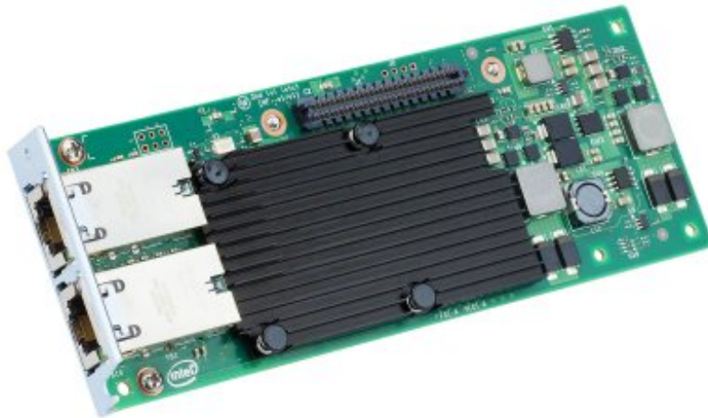
Figure 3. Intel X540 Dual Port 10GBase-T Embedded Adapter

The following figure shows the Intel X540 Dual Port 10GBase-T Embedded Adapter.