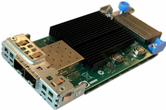
Figure 7. ThinkServer X520-DA2 AnyFabric 10Gb 2 Port SFP+ Ethernet Adapter

The following figure shows the ThinkServer X520-DA2 AnyFabric 10Gb 2 Port SFP+ Ethernet Adapter.