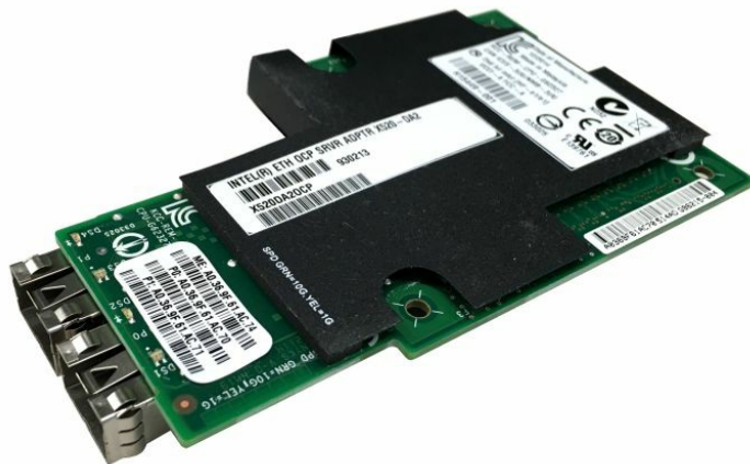
Figure 4. Intel X520 Dual Port 10GbE SFP+ OCP Mezz

The following figure shows the Intel X520 Dual Port 10GbE SFP+ OCP Mezz adapter for use in the ThinkServer sd350.