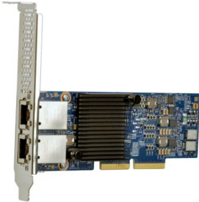
Figure 5. Intel X540 ML2 Dual Port 10GbaseT Adapter

The following figure shows the Intel X540 ML2 Dual Port 10GbaseT Adapter for those System x servers with an ML2 adapter slot.