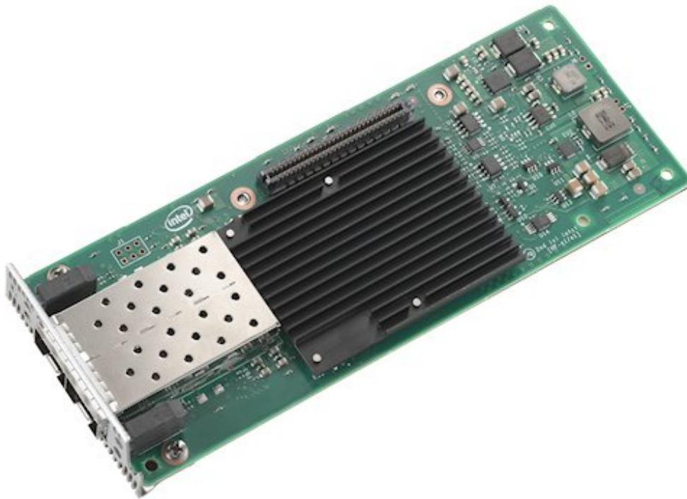
Figure 6. Intel X520 Dual Port 10GbE SFP+ Embedded Adapter

The following figure shows the Intel X520 Dual Port 10GbE SFP+ Embedded Adapter.