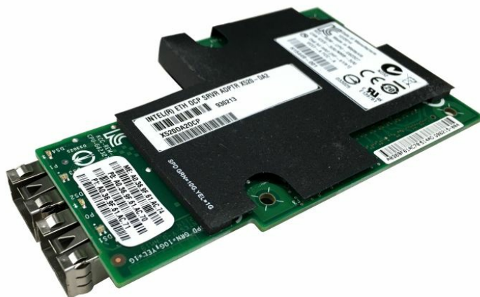
Figure 4. Intel X520 Dual Port 10GbE SFP+ OCP Mezz

The following figure shows the Intel X520 Dual Port 10GbE SFP+ OCP Mezz adapter for use in the ThinkServer sd350.