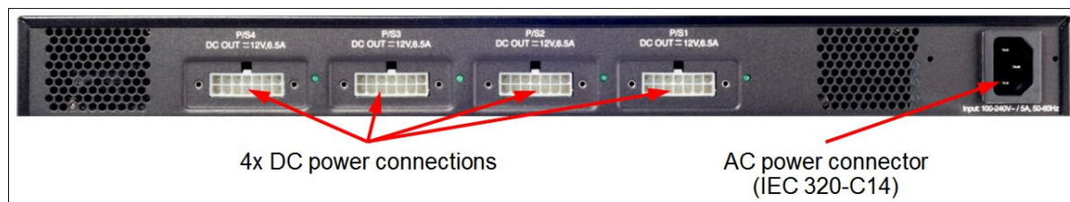
Figure 5. Rear panel of the RackSwitch G7000 RPS option

The rear panel of the RackSwitch G7000 RPS option is shown in the following figure.