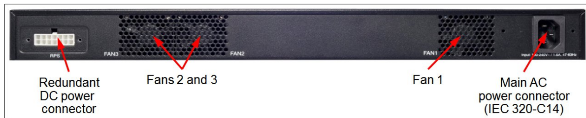
Figure 4. Rear panel of the RackSwitch G7028

The rear panel of the RackSwitch G7028 is shown in the following figure.